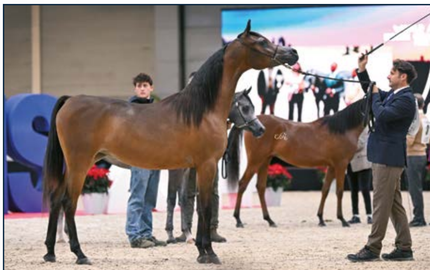
TROPHY «ESPOIR» FEMALE: SULTANA AL THAMER BREEDER: AL THAMER STUD (QA) OWNER: AL THAMER STUD (QA)