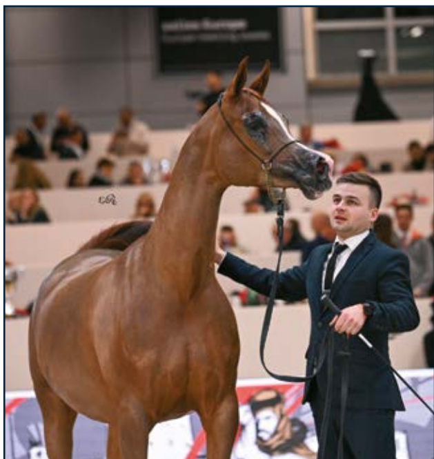
BEST MOVEMENT FEMALE: POGANKA BREEDER / OWNER: STADNINA KONI MICHAŁÓW SP. Z O.O. (PL)