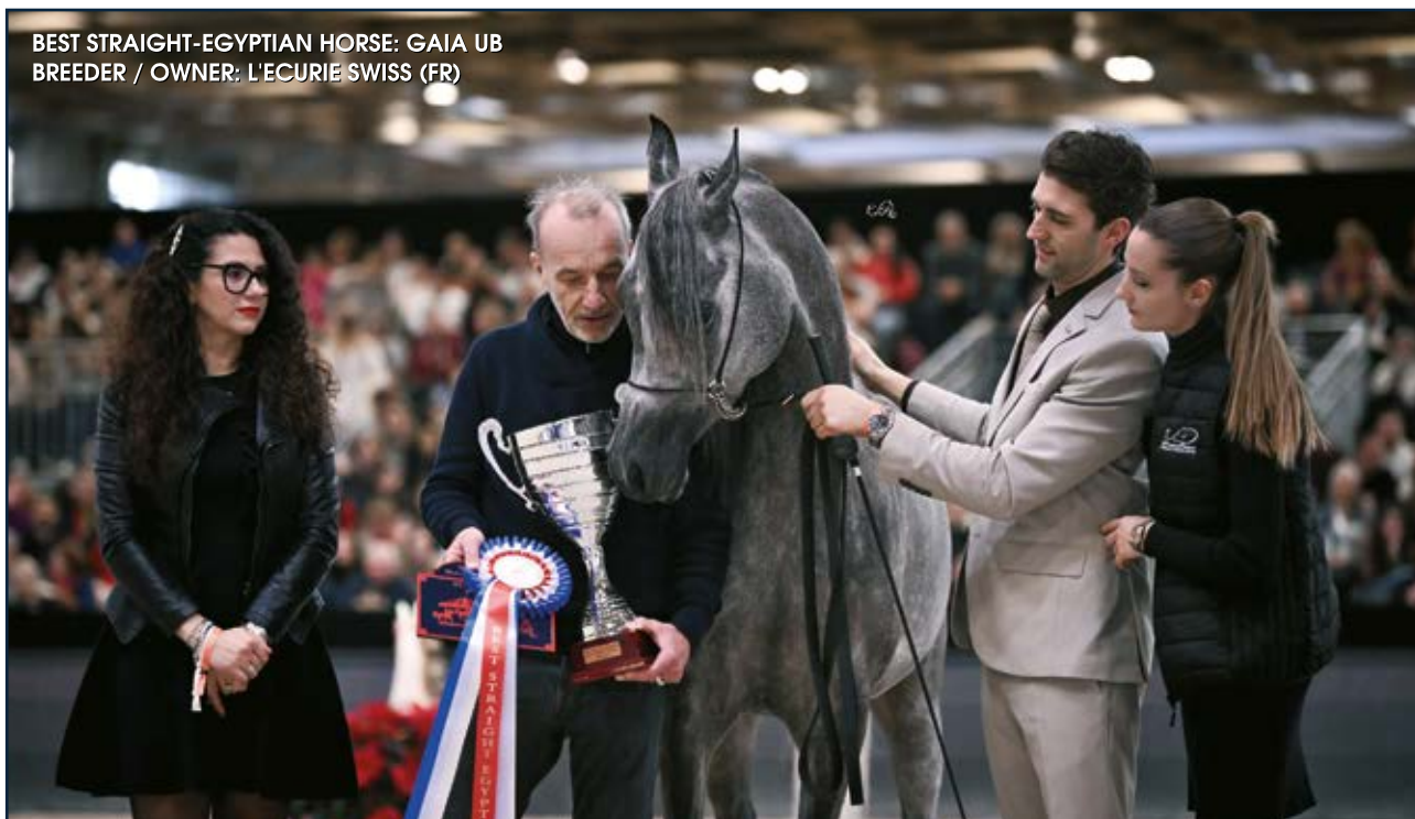
BEST STRAIGHT-EGYPTIAN HORSE: GAIA UB BREEDER / OWNER: L'ECURIE SWISS (FR)

Yaell (Kanz Albidayer x Forelocks Yessy), bred and owned by Forelocks Arabians from The Netherlands.