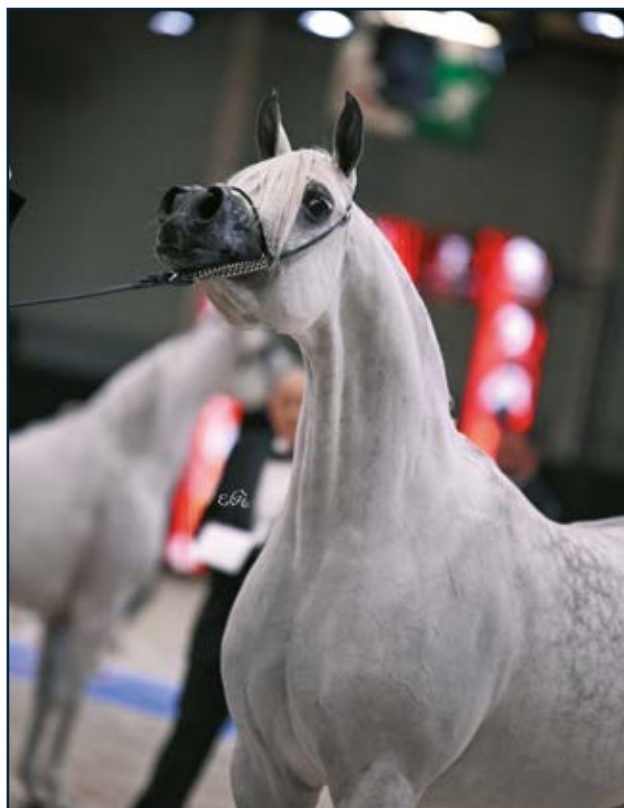
HIGHEST SCORE IN THE SHOW: AJ KAYYA BREEDER / OWNER: AJMAN STUD (UAE)

el Rasheem x SQ Miss Enzo), bred and owned by Al Saqran Stud from Kuwait.